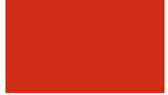
Traffic Red - RAL NO. 3020