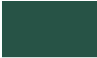
Moss Green - RAL NO. 6005