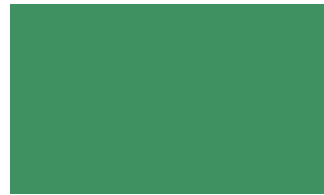
Signal Green - RAL NO. 6032