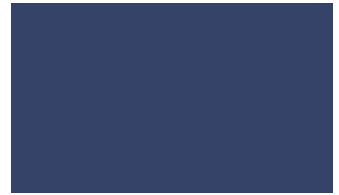
Sapphire Blue - RAL NO. 5003