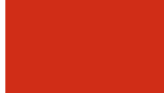
Traffic Red - RAL NO. 3020